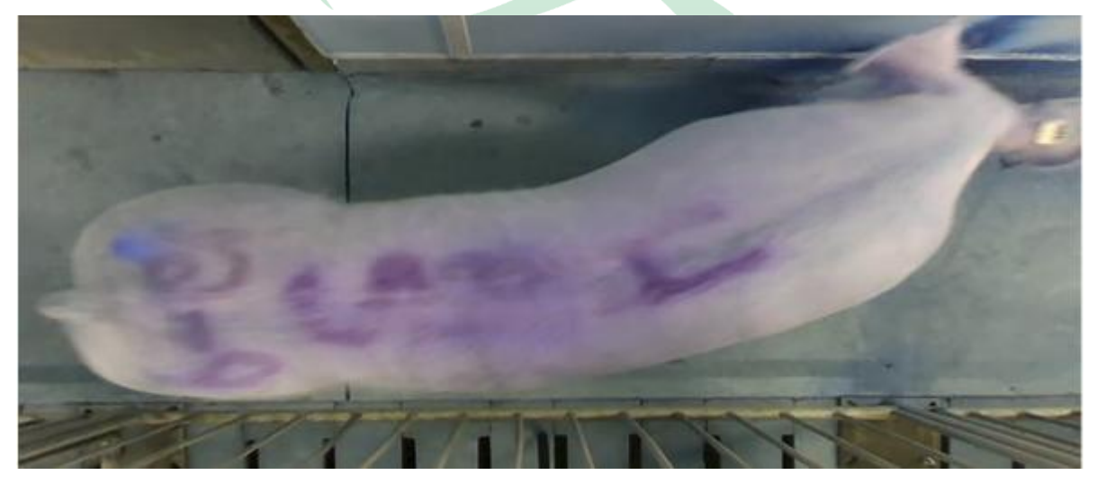
Figure 2. Painted numbers and ear tag for optical character recognition on a sow. www.justagriculture.in

A low-cost identification system, optical character recognition, is the recognition of printed, stamped, or written text characters (e.g., license plates, barcodes, and QR codes) by a computer. In pig production, optical recognition includes characters on ear tags or painted symbols and numbers (Figure 2). Optical character recognition is performed with a digital camera and data is developed with machine learning to provide remote identification (Mittek et al., 2017). Depending on the clarity and color of the markings, there is the capacity to identify large permutations of animals and, with the exception of optical character recognition on tags, the identification may not need to be removed from pigs prior to slaughter. When the characters are painted, visual identification patterns can fade within a day and when pigs lie close to or on one another, pattern recognition is occluded (Lancaster et al., 2012).